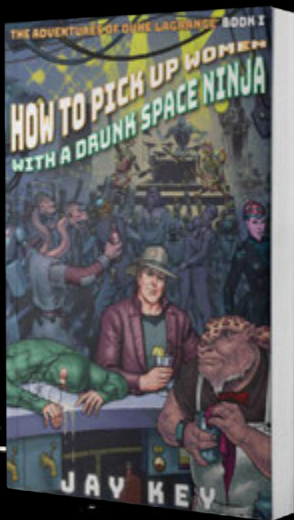
How to Pick Up Women with a Drunk Space Ninja

Bounty hunters. Ninjas. Magic orbs. Anthropomorphic musk oxen from the moons of Gartosh. Theme parks made exclusively of fungal-derived meat alternatives. Welcome to the gut busting and page turning universe of Duke LaGrange!