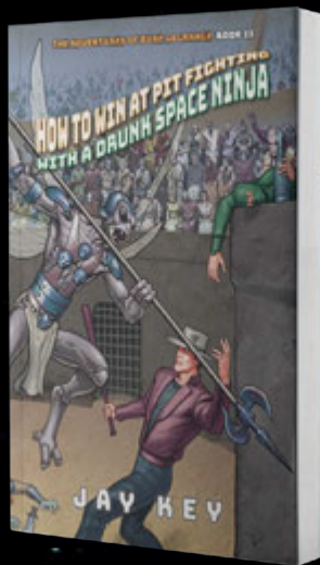
How to Win at Pit Fighting with a Drunk Space Ninja