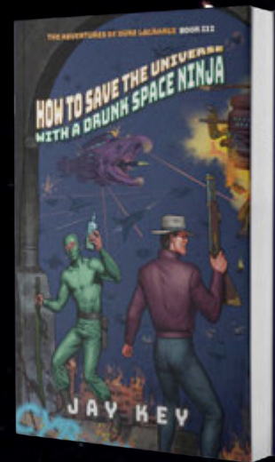
How to Save the Universe with a Drunk Space Ninja